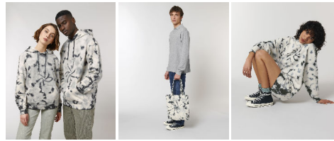
Cruiser Tie and Dye Tote Bag Tie and Dye Stella Kicker Tie and Dye